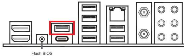
Rear I/O Interface

Plug your FAT/FAT32 USB drive into the correct USB port as below: